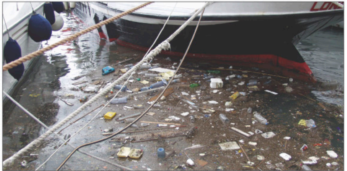
Ta' Xbiex: Not all that floats at the yacht marina is to be admired.